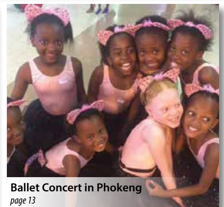
Ballet Concert in Phokeng page 13