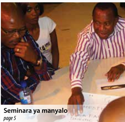
Seminara ya manyalo page 5