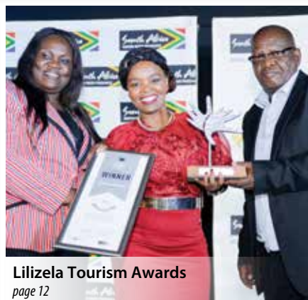
Lilizela Tourism Awards page 12