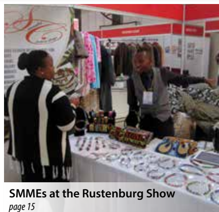
SMMEs at the Rustenburg Show page 15