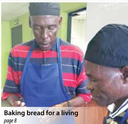
Baking bread for a living page 8