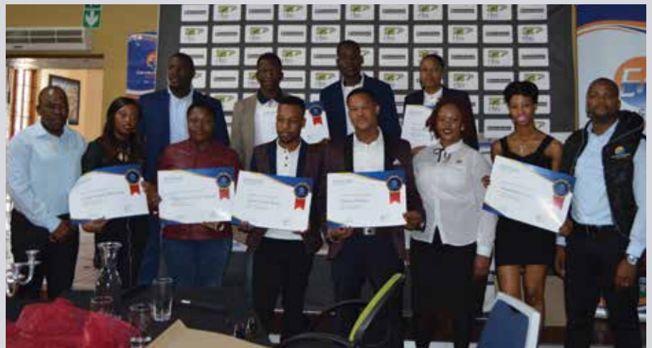
Community members who qualified as fitness and personal trainers

Royal Bafokeng Sports is proud to have sponsored the training of a group of young people to enhance and support its sport development programmes in various villages. Twenty local people received generic coaching certificates while eight received fitness and personal training certificates. The group was awarded certificates at a graduation ceremony held at Impala Rugby Club in Rustenburg on 4 May.