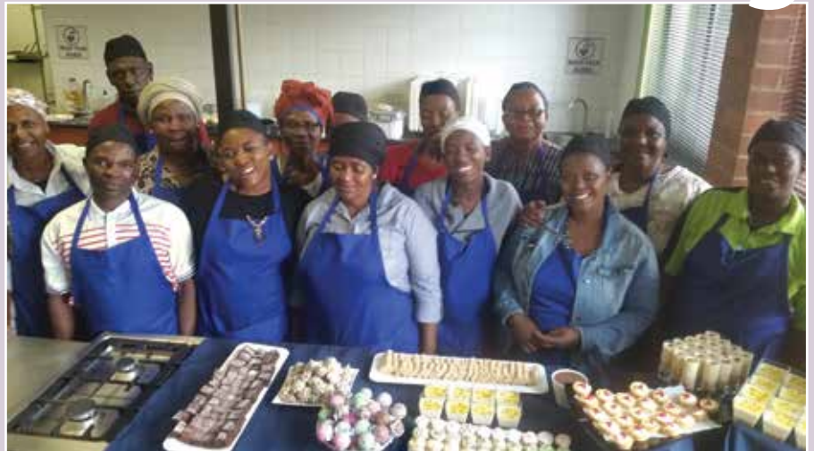
Some of the mouth-watering cakes the group baked.

A week long practical training in baking attracted a number of passionate men and women from various cooperatives in the villages. The training which was offered by Professional Cooking Academy, was aimed at enhancing their expertise in baking quality and marketable products.