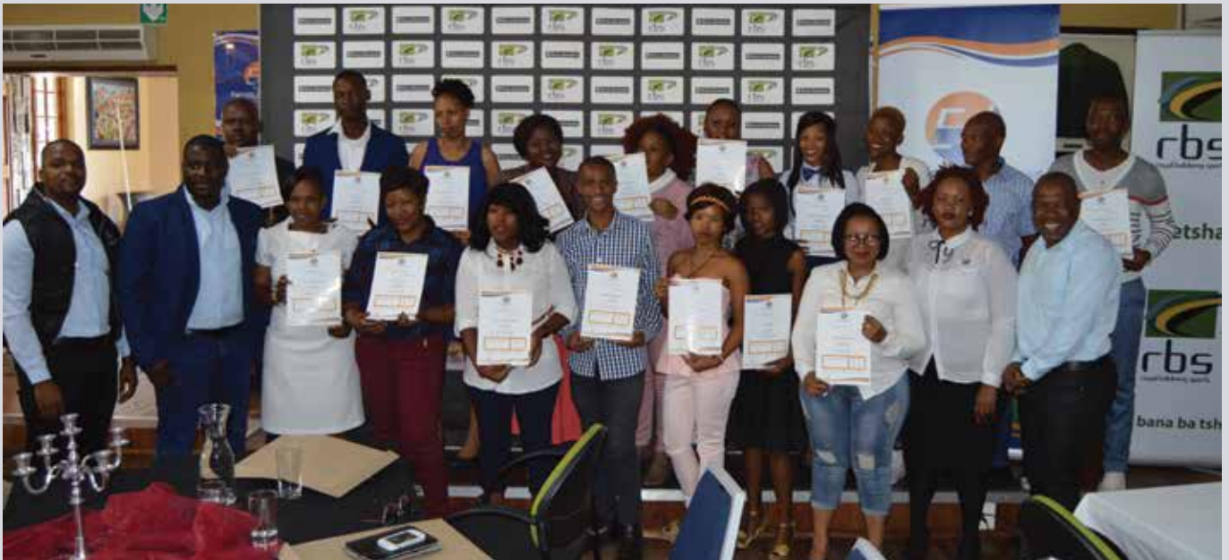
Community members who qualified as sport coaches.

Royal Bafokeng Sports is proud to have sponsored the training of a group of young people to enhance and support its sport development programmes in various villages. Twenty local people received generic coaching certificates while eight received fitness and personal training certificates. The group was awarded certificates at a graduation ceremony held at Impala Rugby Club in Rustenburg on 4 May.