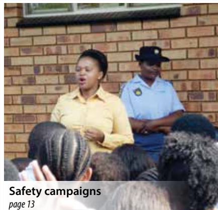
Safety campaigns page 13