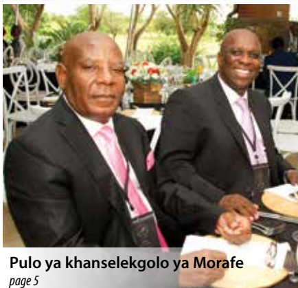
Pulo ya khanselegolo ya Morafe page 5