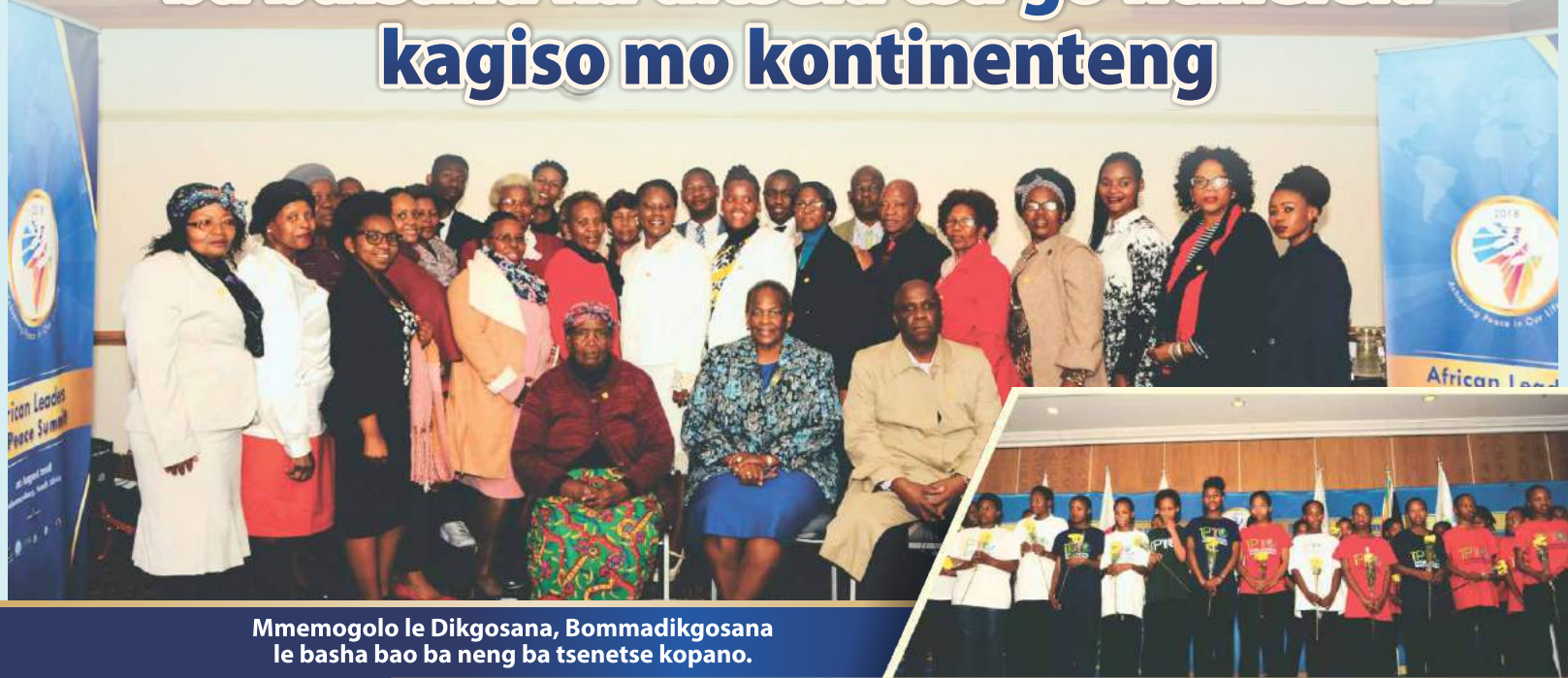
Mmemogolo le Dikgosana, Bommadikgosana le basha bao ba neng ba tsenetse kopano.