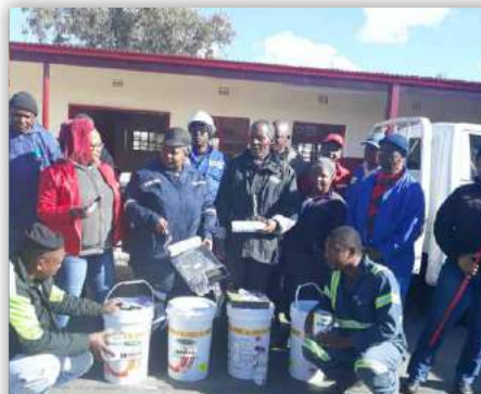
Celebrating Mandela Day page 14