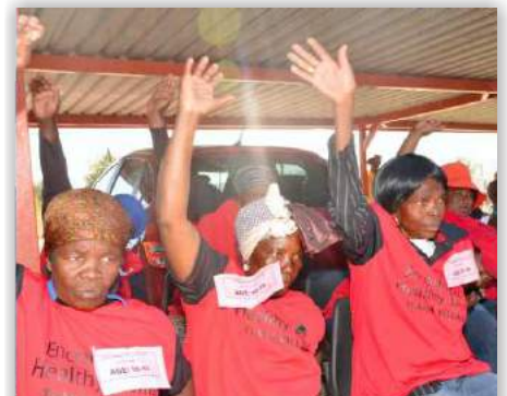
Ditirelo tsa go tokokafatsa maphelo a bagodi - page 18