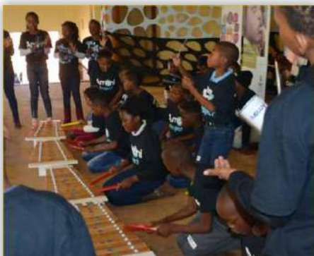
Project Amani launched in schools page 17