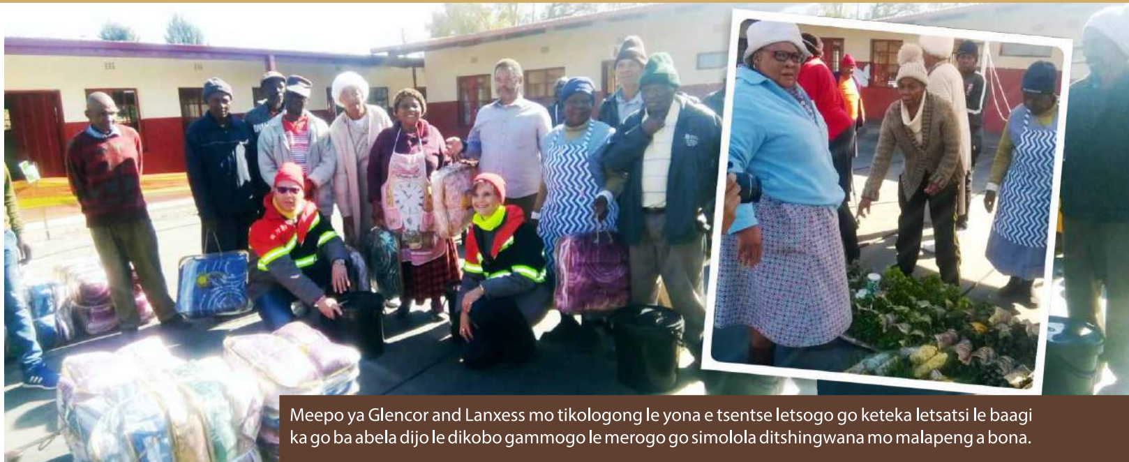
Meepo ya Glencor and Lanxess mo tikologong le yona e tsents'e letsogo go keteka letsatsi le baagi ka go ba abela dijo le dikobo gammogo le merogo go simolola ditshingwana mo malapeng a bona.