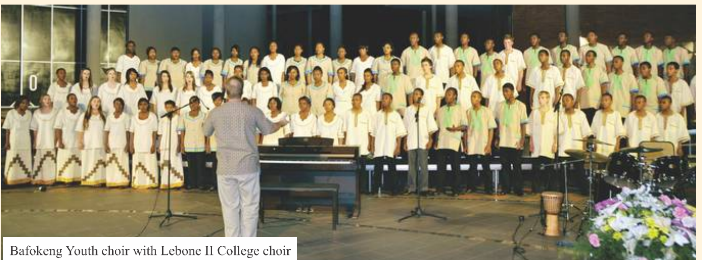
Bafokeng Youth choir with Lebone II College choir