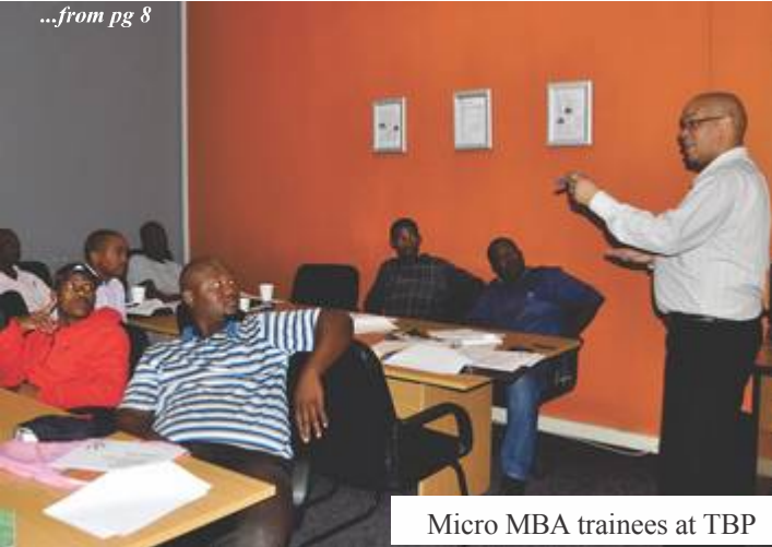
Micro MBA trainees at TBP