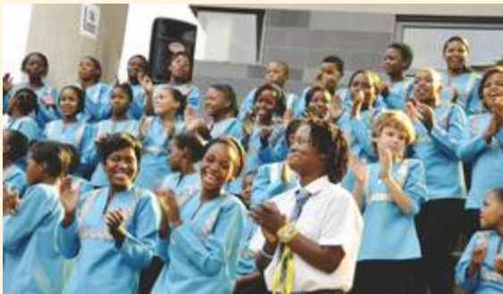
Laerskool Rustenburg Noord choir