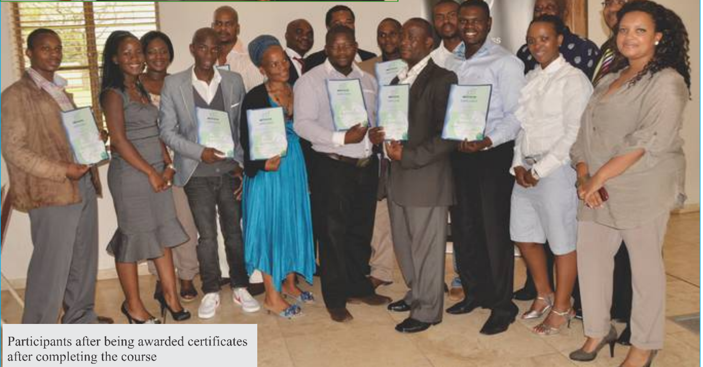
Participants after being awarded certificates after completing the course