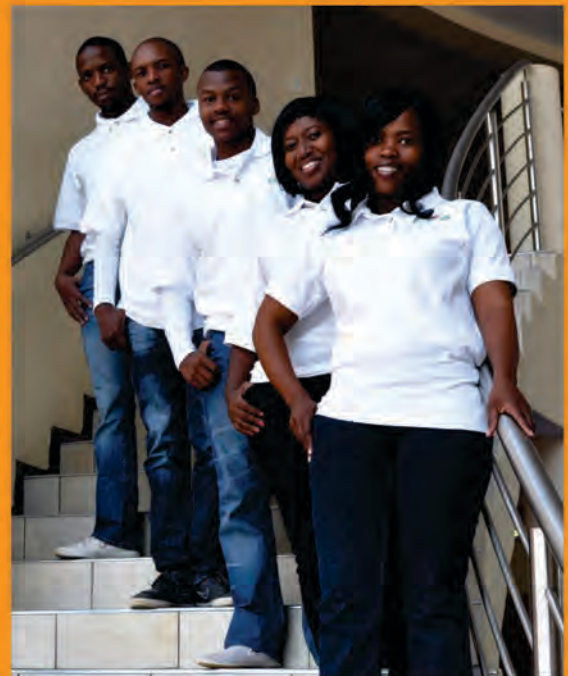
Students take a TRIP down the road to success. From top:

The RRT continues to engage youth as key stakeholders of the project for the duration of its current planning, design and construction phase. In July, it will embark on a series of fun and interactive expos across schools in Rustenburg that will showcase the routes and stations to graduates and students. The RRT also has a stand at the upcoming Waterfall Mall Careers Expo in Rustenburg for all interested graduates. Watch the press for details!