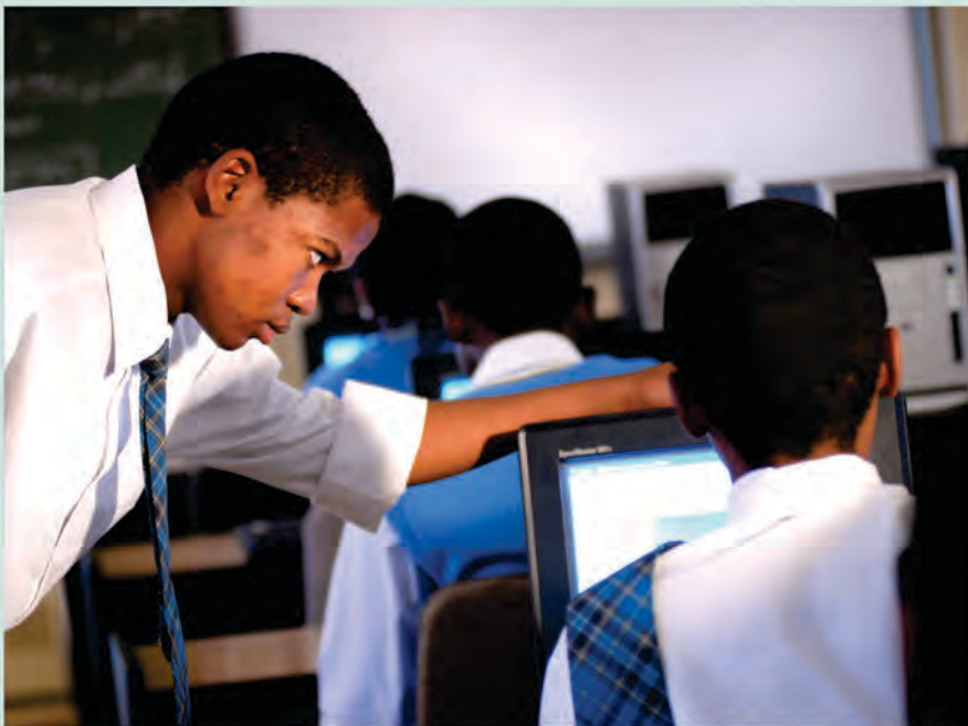
Learners use computers to enrich their skills