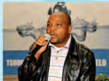
RBN Leadership making their point during the 'Save Water' campaign held recently

Production costs (maintenance) and capital costs (Lefaragatlhe Reservoir Project) all constitute the overhead statement that enables clean water supply to every household within the RBN," he explained.