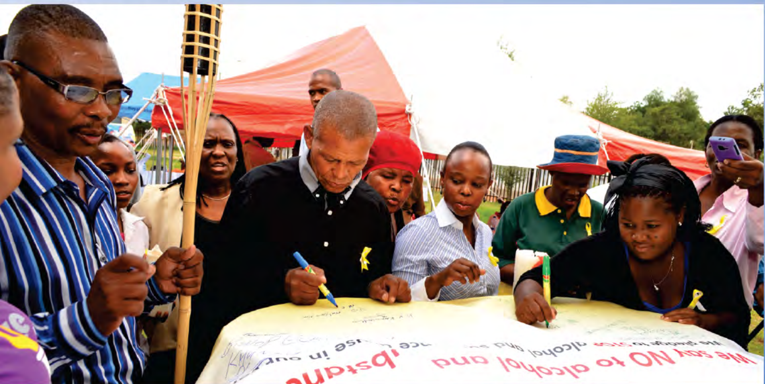
Members of the community pledging to say No to alcohol and substance abuse at the launch of the campaign in Luka

2009. To schedule an appointment with a nurse or learn more about the facility, you may contact the Centre on 014 566 1334