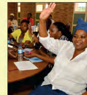
Thuto ka puo ya fa gae e bona maungo