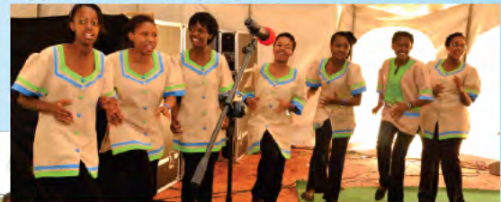
Bafokeng Youth Choir performing at the Kgothakgothe