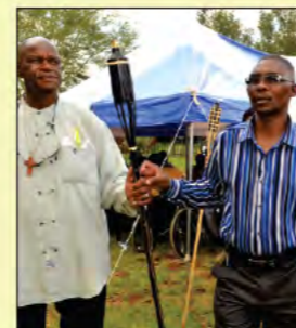
Substance abuse outpatient clinic is launched in Luka