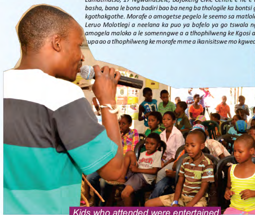
Kids who attended were entertained

Lamatlhatso, 17 Ngwanatsele, Bafokeng Civic Centre e ne e thanasela ka baagi bao ba akaretsang bagolo, basha, bana le bona badiri bao ba neng ba thologile ka bontsi go tla go tsenela kopano ya bofelo ya ngwaga ya kgothakgothe. Morafe o amogetse pegelo le seemo sa matlole sa Royal Bafokeng Nation, mme morago Kgosi Leruo Molotlegi a neelana ka puo ya bofelo ya go tswala ngwaga. Batla pitsong ba nnile le tshono ya go amogela maloko a le somenngwe a a tlhophilweng ke Kgosi a khansela ya setso. Maloko ano a tlaletsa a le tupa ao a tlhophilweng ke morafe mme a ikanisitswe mo kgweding ya Phatwe monongwaga.