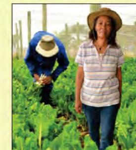
Agriculture is a weapon against poverty