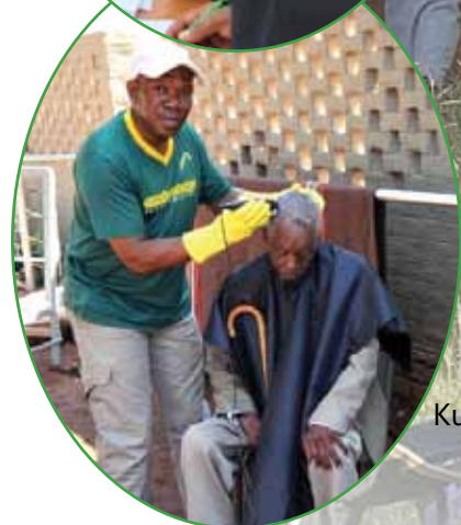
Kutlwanong Old Age Home Page 17