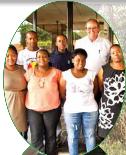
Puisano study Page 4