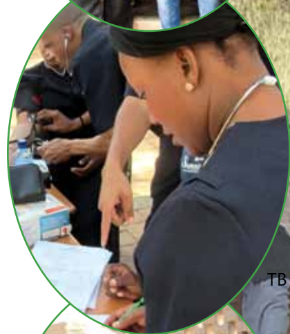
TB Awareness Day Page 7