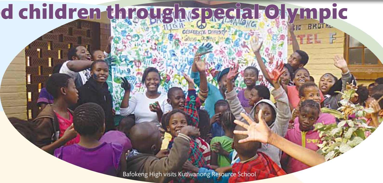
Bafokeng High visits Kutlwanong Resource School

Promoting tolerance and celebrating diversity of all abilities are central pillars of Special Olympics. Learners from Bafokeng High explained why diversity is so important in the world by saying, "When we recognize and accept diversity and differences, we acknowledge that everybody does not have to be the same by believing in or doing the same things. Diversity is an asset to our development and welfare and should be valued, enjoyed, respected, accepted and embraced as an aspect of life that enriches and educates."