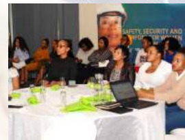
Pg 8 Women in Mining