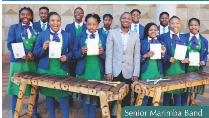
Senior Marimba Band