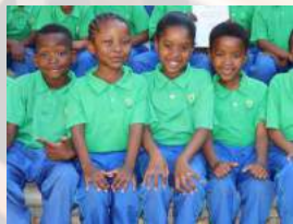
Pg 17 Platinum Winners