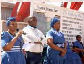
Pg 4 Leeto la Kimberley