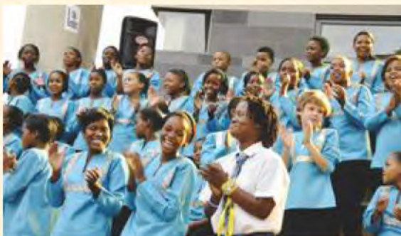
← Laerskool Rustenburg Noord choir