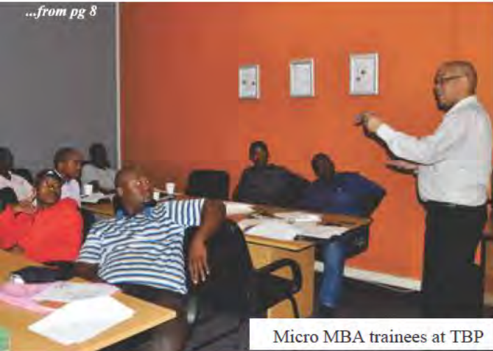
Micro MBA trainees at TBP