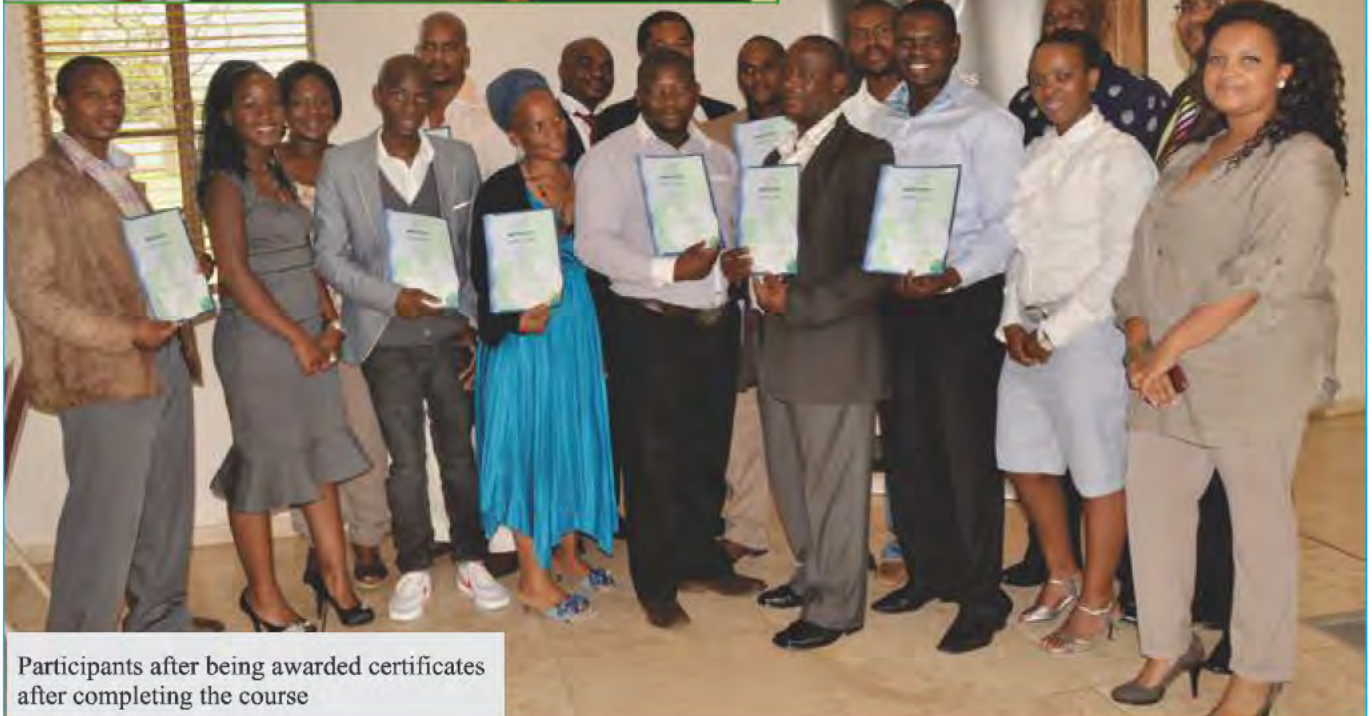
Participants after being awarded certificates after completing the course

She said the Business Place is not only for business owners who have already established themselves, but also for those who still aspire to start their own businesses.