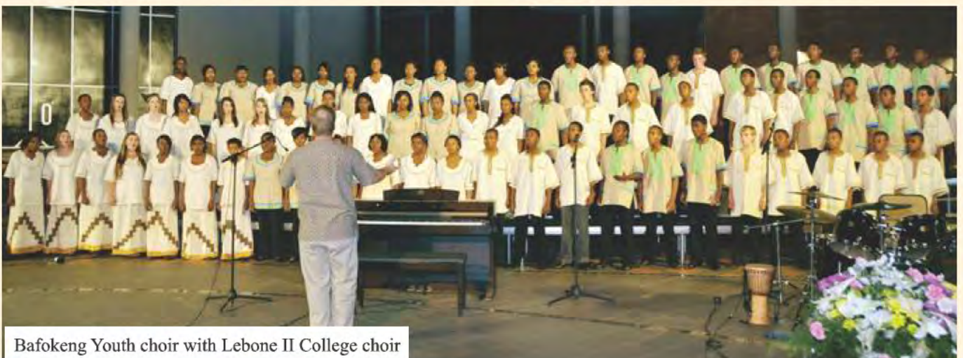
Bafokeng Youth choir with Lebone II College choir