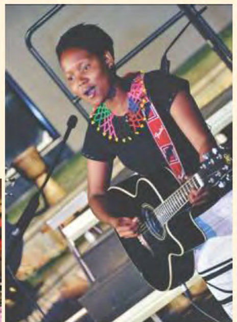
Rustenburg Hoerskool choir ↓